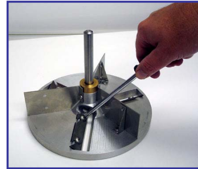
Remove the blades with a No. 2 Philips head screw driver.

Next, remove the blade screws and all of the blades from the cutter and set them aside. Then remove the 6 screws that hold the fins in place and set the screws and fins aside. Look at the cutter and cylinder for any mineral deposit buildup. If there is any, clean these parts in the same manner that the cabinet was cleaned. Make certain to remove all buildup from the flat surfaces where the blades fit. This is critical! If mineral deposits are left on these surfaces, calcium crystals will form underneath the blades. Since the blades are held firmly in place with screws, the crystals will push up against the blades cracking them at their weakest point - the blade slots.