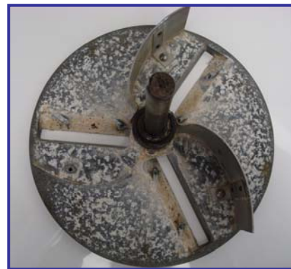
Cutter has been neglected and shows severe mineral deposit buildup. Regular cleaning and maintenance would have prevented this.

Now it is time to start putting it all back together. Squirt a small amount of foodservice grease into all of the screw holes. This is the Petro Gel grease that comes with your machine. Use your finger to push the grease down into the holes. Attach the fins first. Insert a screw into the tab of a fin. This is the part that screws into the hub of the cutter. Turn the screw until it's held in place by the threads, but not all the way. Then while holding the fin up a little, insert the other screw into the tab on the fin and screw it into the