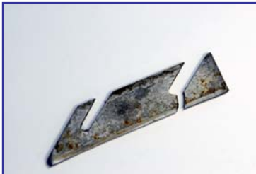
This blade has cracked as a result of calcium deposits which formed on the underside. Water trapped between the blade and the cutter caused a catalytic reaction to occur. Calcium crystals formed and pushed up against the blade, cracking it at its weakest point; the screw slot.

At the start of each season, we have several customers who bring their cracked blades in wondering what happened. After an examination of the backside of their blades we saw that they were coated with calcium deposits. What happened? They simply turned off their machine at the end of the season without performing any end of year maintenance. The water trapped between the blades and the cutter formed calcium deposits and when the deposits formed crystals, which grew – they cracked the blades. Then at the beginning of the next season when they went to remove the blades to put in a fresh set, they found that their blades had cracked. So it is very important to remove any calcium deposit buildup from the blade slots.