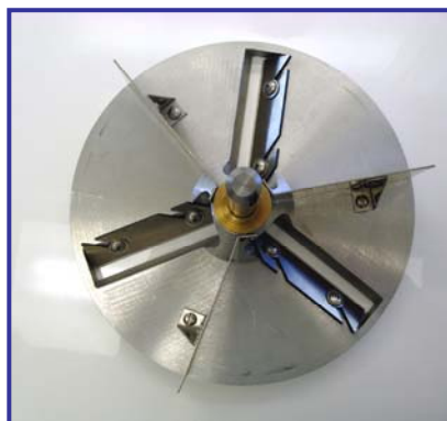
Cutter has been cleaned regularly and is well maintained.

Now let's go back to the cutter. Once the cutter has been cleaned of mineral deposits, thoroughly wash it with soapy water and then rinse it in very hot water . Let the water run over the cutter until it heats up the metal. Dry the cutter off well with a towel. As best as possible, blow through the screw holes to remove any water. Set the cutter down and let it rest for a while so that all water can evaporate from the screw holes.